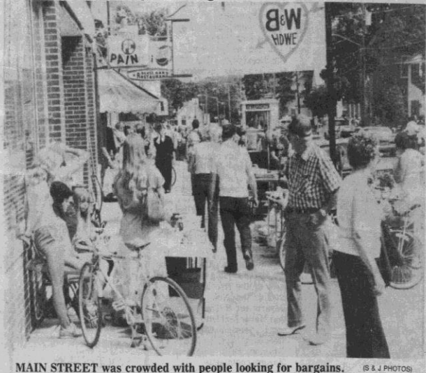
MAIN STREET was crowded with people looking for bargains.